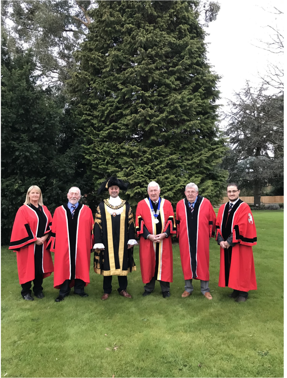
Common Hall April 2022