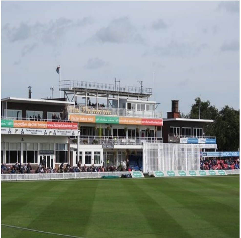
Leicestershire County Cricket Club Grace Road Leicester