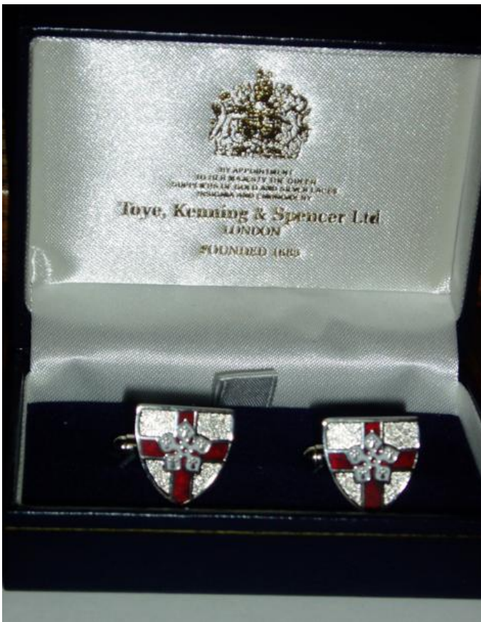
GILD CUFFLINKS IN BOX