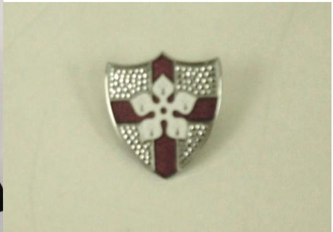
GILD LAPEL BADGE